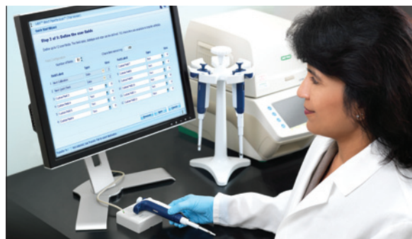
The optional RFID reader works with all Rainin RFID-enabled pipettes, and interfaces with METTLER TOLEDO's LabX™ Direct Pipette-Scan™ calibration check.